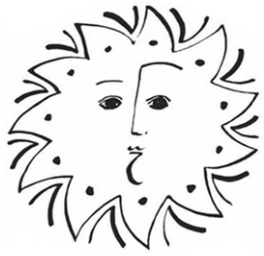
Historic College Park Neighborhood Association